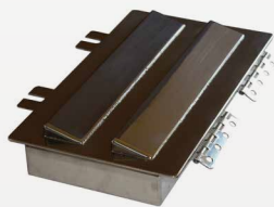
Plate Magnets can be configured into 'Deep Reach' or 'Diagonal Leg' housings for deeper product burdens.

Available in a range of housings and with Ferrite or high intensity Rare Earth magnetic material.