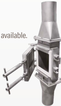
See Fig. 1