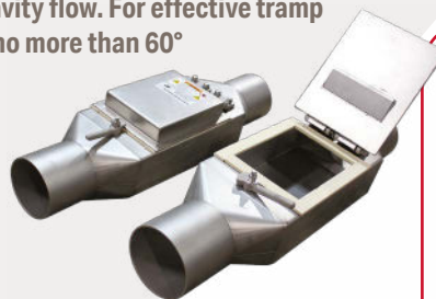
See Fig. 1